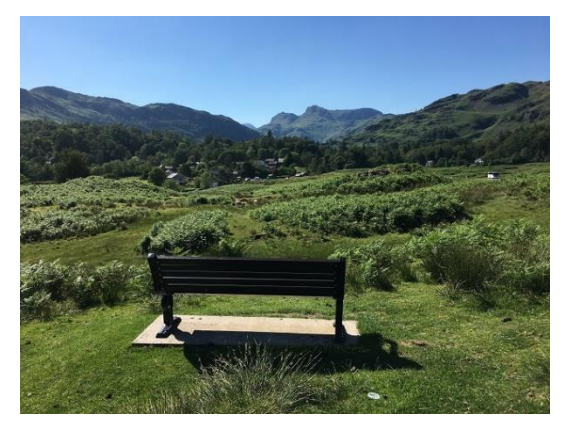
Langdale from Elterwater Common

Continue over a cattle grid, the road meanders through some pleasant Lakeland scenery with glimpses of Elterwater lake then the River Brathay through trees on the right. Soon, pass Silverthwaite pay and display car park on the left and