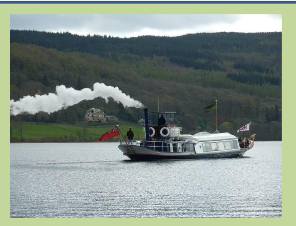
SY Gondola & Brantwood

Coniston Water is a scenic and relatively quiet lake surrounded by low and mostly wooded hills. It is well worth taking a trip on the lake to better appreciate the scenery and you can do this either on the historic Steam Yacht 'Gondola' or the Coniston Launch. If you fancy hiring a boat yourself, the Coniston Boating Centre is adjacent to the car park with a good selection of small boats and paddle boards. Across the lake, you can just about make out Brantwood house