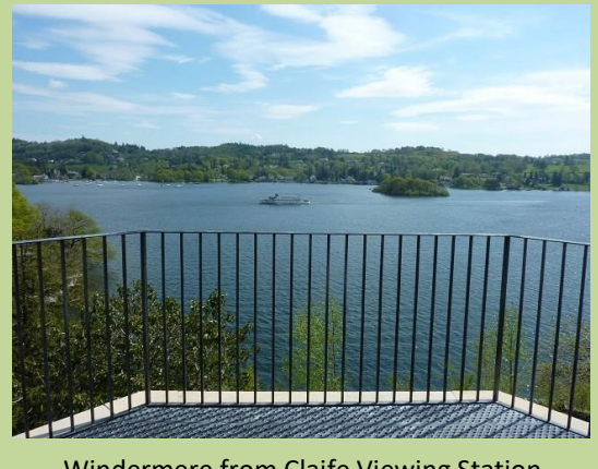
Windermere from Claife Viewing Station

Back towards the ferry from the car park is Claife Viewing Station, built in the 1790's it provided a wonderful viewpoint over Windermere lake and was a popular tourist attraction before falling into disrepair at the end of the 19th century. It has recently been tastefully restored and again provides wonderful and peaceful views over the lake with free entry. The Station is a short uphill walk from the road and from Joey's Cafe which provides refreshments. National Trust pay and display car park, toilet facilities at Ferry House.