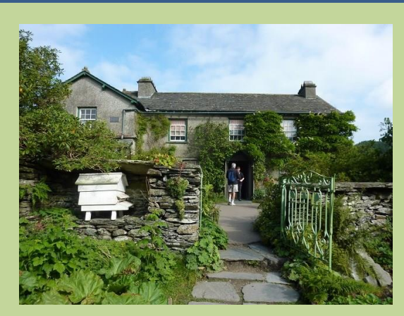
Hill Top house

Retrace your steps back past Joey's Cafe and turn right at the T junction towards Sawrey. The tight road follows the lakeshore for a short distance and passes the National Trust car park at Ash Landing on the right before climbing steeply away from the lake. Once over the top, there are some lovely views over lush pastures and wooded hills towards distant mountains, with the isolated St Peter's Church nearby on left. Soon, you pass through the small village of Far Sawrey, with the Cuckoo Brow Inn on the right where you could get refreshments. Shortly, enter the neighbouring village of Near Sawrey, passing the pedestrian entrance to Hill Top and the Tower Bank Arms on the left. The car park for Hill Top is just beyond the pub on the left.