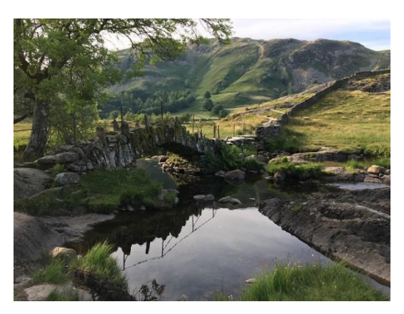
Slater Bridge, Little Langdale

Continue over the River Brathay and, just beyond, take the left turn to Little Langdale. The road generally climbs through trees for approx 1 mile before reaching the hamlet of Little Langdale with the traditional looking Three Shires Inn on the right. Beyond this the road becomes quite narrow and twisty but the views are magnificent over Little Langdale valley, surrounding mountains and Little Langdale Tarn on the left. You can certainly appreciate the remote beauty of this valley. Not far beyond the tarn, cross a cattle grid and take the right fork in the road towards Blea Tarn. The road climbs quite steeply in places, again with fabulous views. After approx 0.7 miles, cross another cattle grid and Blea Tarn car park is immediately on the right.