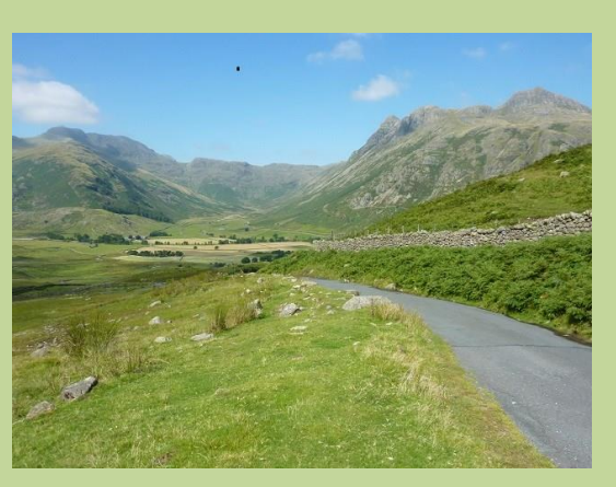
Upper Great Langdale

Great Langdale is a wonderful Lake District valley with spectacular scenery all around. The enclosed valley is surrounded by some mighty Lakeland mountains such as Langdale Pikes, Bowfell, Crinkle Crags and Pike O'Blisco. The road runs along the green valley floor as far as Old Dungeon Ghyll which is a popular starting place for many mountain walks. A good way to appreciate the surroundings more is by walking the relatively level but rough track which continues up Mickleden valley for approx 2 miles from the car