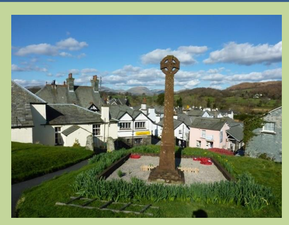
Hawkshead Village from the churchyard

Turn right out of the car park, past the visitor centre, climbing away from the lake. The trees soon thin out and good views open up over surrounding countryside, including glimpses of Esthwaite Water and Lakeland mountains in the far distance. The road is never far from the western shore of Esthwaite Water and after approx 1.8 miles you enter the outskirts of Hawkshead village. The road turns sharply to the right and just beyond, take the left turn to Hawkshead, then very shortly the next left which leads to the village car park on the left.