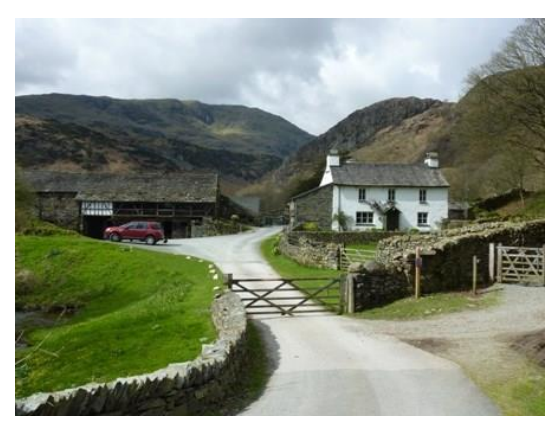
Yew Tree Farm

Travel back up Lake Road to the T junction and turn right on the A593, passing through Coniston village towards Ambleside. Beyond the village, the road passes through the attractive Yewdale valley with craggy and wooded hills on each side. Approx 2 miles out of Coniston is Yew Tree Farm on the left, which is a picture book farm and setting, once owned by Beatrix Potter. The farmhouse was used as the double for Hill Top in the 2006 film 'Miss Potter'. The farm now offers Herdwick sheep experiences where you can get up close to these popular animals. Just beyond the farm is Glen Mary Bridge National Trust car park on the right and just beyond that on the left is Yew Tree Tarn which is man made in a lovely setting. There is a small layby to pull in and