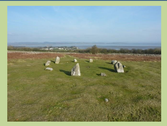
Druid's Circle, Birkrigg Common

The area around Birkrigg Common contains a number of Bronze Age relics and the Druid's Stone Circle is one of the more impressive. There are two roughly concentric stone circles, although the outer one is mostly obscured by turf and vegetation. The double circle is quite unique in the UK and evidence indicates that it was used for burials. Although relatively small and not quite complete, it is worth visiting if only for the surrounding views. The circle is approx 100m