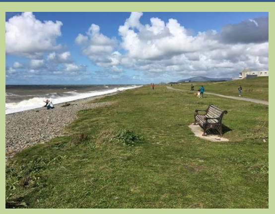
Biggar Bank, Walney Island

Turn left out of the car park and retrace your steps to the Henry Schnieder roundabout where you take the third proper exit. The wide road soon crosses a bridge over the dock area and enters Barrow Island which is home to Barrow Shipyard and many old tenement properties that were originally built for the booming shipyard population. Shortly, meet a roundabout and take the third exit, continuing past more shipyard buildings to meet a further roundabout where you take the first exit to Walney. The road then crosses the impressive Jubilee Bridge over the Walney Channel to enter Walney Island. Turn left at the following traffic lights towards South Walney. The road briefly follows Walney Channel, mostly mud if the tide is out, before heading inland across the narrow island. Pass a tidal inlet on the left and soon the road meets the western shore at Biggar Bank. The road bears left and roadside parking is a short distance on the right.