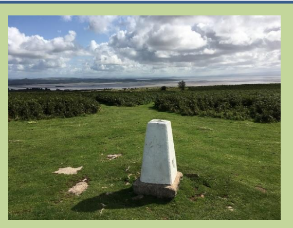
Birkrigg Common summit

Opposite the parking area, next to the toilets, is a minor road which you take to enter the village of Bardsea. Continue through the village, passing Holy Trinity Church on the right, in an imposing position with views over Morecambe Bay. Soon, pass the Ship Inn on the left and just beyond is a left turn to Urswick which you take. The narrow road climbs out of the village and through lush pastures for approx 0.9 miles to cross a cattle grid and on to Birkrigg Common which is predominantly open grass and bracken. There are good views on the right, back towards Ulverston, and a number of places to pull in and admire the area. Continue to a T junction where you turn left, then in a short distance turn left again as the road circumnavigates the Common. Continue to climb for approx 0.3 miles to a small and rough roadside parking area which gives the easiest access to Birkrigg Common summit area.