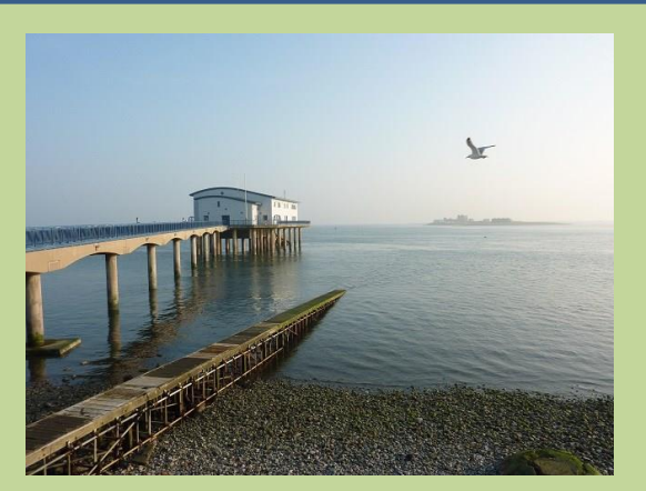
Piel Island from Roa Island

Continue along the coastline road for approx 2.5 miles to a roundabout where you take the first exit to Rampside. Again, following the coastline, you soon see a very slender tower on the foreshore which dates from the 19th century and served as a navigation beacon for boats approaching Barrow. The road passes through the village of Rampside, including The Clarke's Hotel on the right, before bearing left on to a causeway. The causeway leads approx 0.5 miles to Roa Island and about half way along on the left is a mile long spit of land leading to Foulney Island which can be walked at low tide. Continue on the road to Roa Island, passing through the small settlement to some roadside parking at the end of the road.