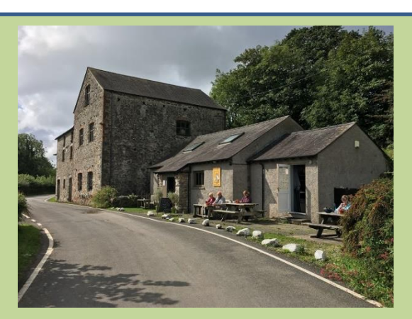
Gleaston Water Mill & cafe

Slightly off the beaten track, Gleaston Water Mill is an impressive historic water corn mill which has been restored to its former glories. The buildings date from 1774 and have an interesting history although were in a bad way until restoration took place during the 1990's. You can wonder around the mill and its museum and see the original milling machinery and 18ft waterwheel. There is also a gift shop and next door is Flours cafe. Mill open Wednesday to Sunday,