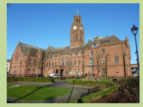
Barrow Town Hall

The large industrial town of Barrow-in-Furness stands in an isolated but attractive location at the tip of the Furness peninsula. It was just a small fishing village in the early 19th century but was transformed following the arrival of the Furness Railway in 1846 which allowed a large iron and steel industry to develop. As the steelworks boomed, they apparently grew to be the largest in the world. On the back of this, a large shipbuilding industry flourished and docks