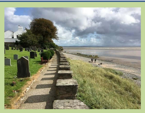
Aldingham sea front

and soon rejoins the A5087 coast road at a T junction where you turn right. The next section of coast road is a delight, passing through Sea Wood, then undulating through green pastures with some fabulous coastal views over Morecambe Bay and ahead towards Blackpool tower in the far distance. Soon, you pass the village of Baycliff on the right and the whitewashed Fishermans Arms Hotel. Continue beyond the village for approx 0.7 miles to a cross roads where you turn left to Aldingham. The minor road soon enters the small village and descends to the coast where there is parking on the left adjacent to the church.