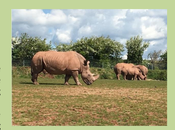
Rhinos at South Lakes Safari Zoo

South Lakes Safari Zoo is a popular wildlife attraction for all the family. The zoo is adjacent to, but well hidden from, the main A590 and has greatly expanded over the years. There are a huge variety of wildlife around the large site, including big cats, giraffes, rhinos, monkeys and South American birds. In some areas of the zoo you can actually mingle with the less dangerous animals, and various zoo keeper and feeding experiences are available for additional cost. The zoo is open daily all year and there are many facilities, including play area, food outlets, gift shop and toilets. Entrance fee applies.