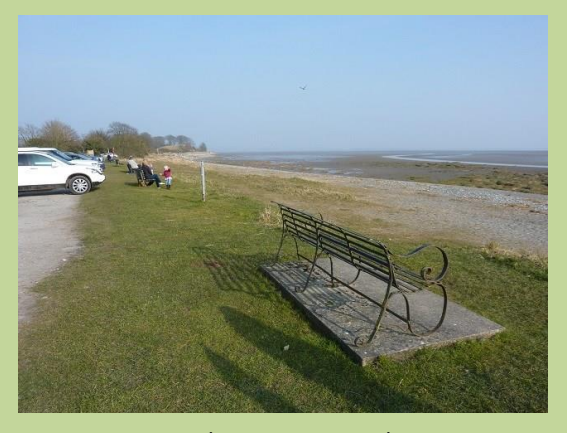
Bardsea Country Park

Bardsea Country Park is a pleasant coastal access area adjacent to the road and near the pretty village of Bardsea. There is plenty of free layby parking alongside the road and some lovely views across Morecambe Bay towards the Lancashire coast and hills. Adjacent to the parking is a grassy area with benches and a pebbly/sandy beach which is fine for a picnic on a good day. At low tide there is a vast area of sand/mud stretching across the bay. You can walk along the