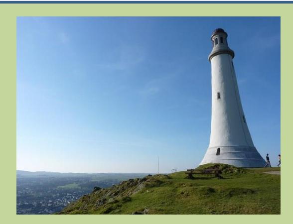
Hoad Monument, Ulverston

The historic market town of Ulverston has a number of attractions for visitors and is worth some exploring. There are plenty of old cobbled streets, interesting buildings, shops, cafes and pubs. It is all centred on the attractive market place which still holds regular markets every Thursday and Saturday. The town is famous as the birthplace of Stan Laurel, born Arthur Stanley Jefferson in 1890. The fascinating Laurel & Hardy Museum is dedicated