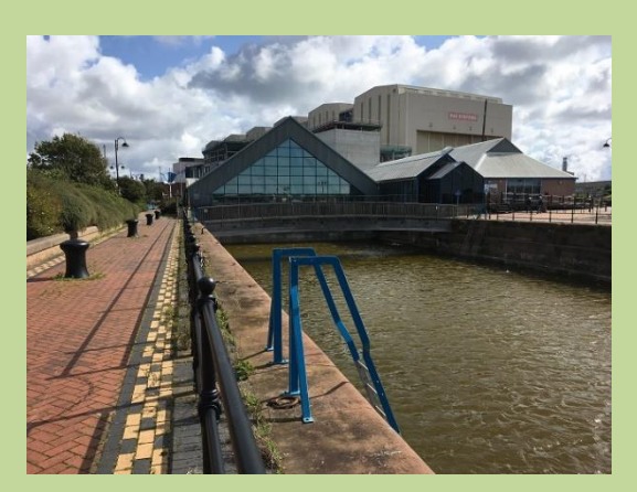
Barrow Dock Museum & Devonshire Dock Hall

Situated over an old dry dock and in the shadow of the massive Devonshire Dock Hall indoor shipbuilding facility is Barrow Dock Museum. This impressive free museum is a great place to discover the interesting history of the local area, including the meteoric rise of Barrow due to steel manufacture and shipbuilding during the 19th century, plus the German bombing of the town and shipyards during the second world war. Long before that there was a Viking influence in the area, before the monks of Furness Abbey settled in the 12<sup>th</sup> century.